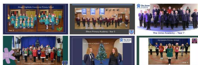
Songbook 2020 – A Whole New World Community Singing Project